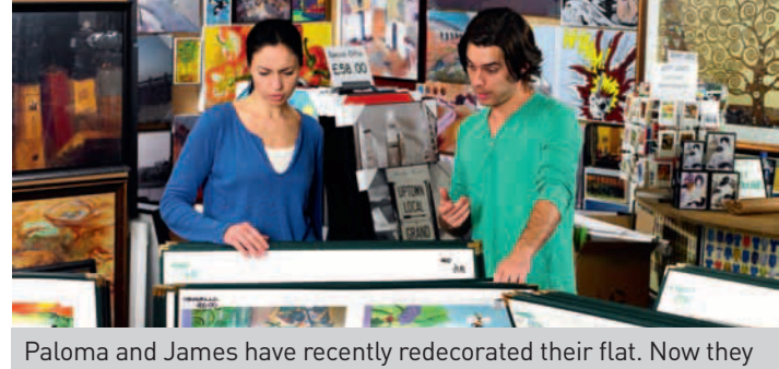
want to buy a poster of a work of art to go in their living room.