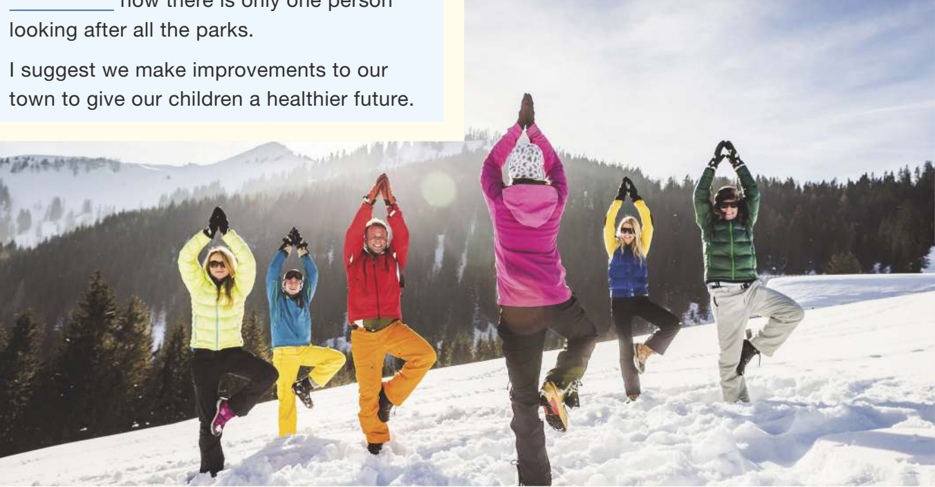
Need help? → Student's Book pages 15–17